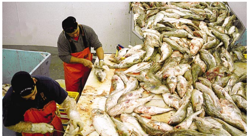
Slippery issue: plans for sustainable fisheries management must also preserve local food supplies.

High on the researchers' agenda is the problem of getting existing scientific expertise to where it is needed. The techniques,