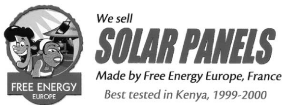
Fig. 3. Best Tested in Kenya Advertisement. Advertisement from Free Energy Europe claiming that their modules are of superior quality based on testing results reported in (Duke et al., 2000).

In theory, a company that invests heavily in advertising its brand must actually deliver high quality goods or else the public will switch to other products rather than pay the price premium necessary to recoup the firm's sunk advertising costs. This strategy does not work well, however, when consumers cannot readily detect poor quality (Ping and Reitman, 1995). As noted above, it is extremely difficult for SHS owners to evaluate the quality of PV modules before or after purchase. Even when modules fail unambiguously, the dispersed nature of the SHS market limits communication of this information about quality among rural households. Rural geography also increases the cost of marketing to this audience. Collectively, these considerations suggest that advertising has limited capacity to signal high PV module quality in this context. 16