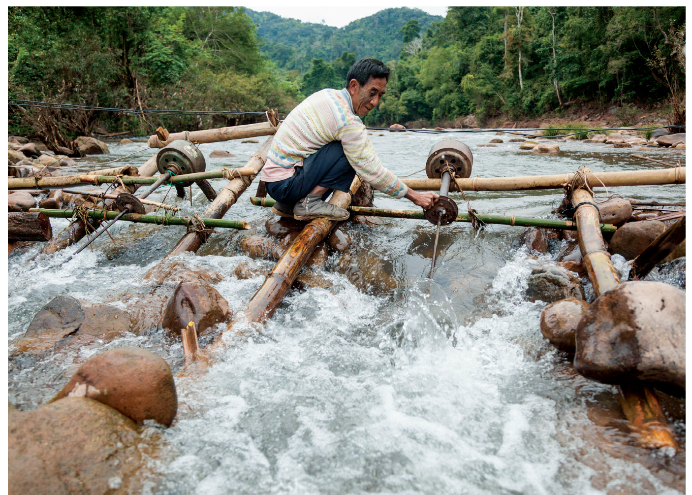
A microhydro turbine on the Nam Ou River in Laos generates electricity for nearby villages.